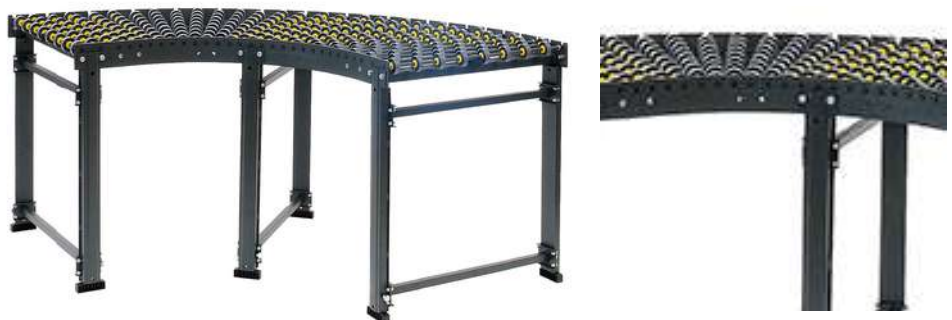
CV- CURVE FIXED WHEEL CONVEYOR