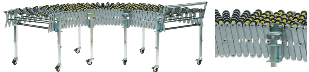
GTL - FLEXIBLE PLASTIC WHEEL CONVEYOR

Flexible conveyors offer a versatile and cost-effective solution for moving products, providing maximum flexibility in terms of length, height, and bending radius. These conveyors are commonly used in packaging lines and at the end of production lines to create box accumulation. Plastic wheels are suggested in case of very low box weight.