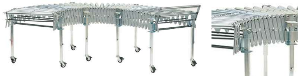
GTR - FLEXIBLE METALLIC ROLLER CONVEYOR