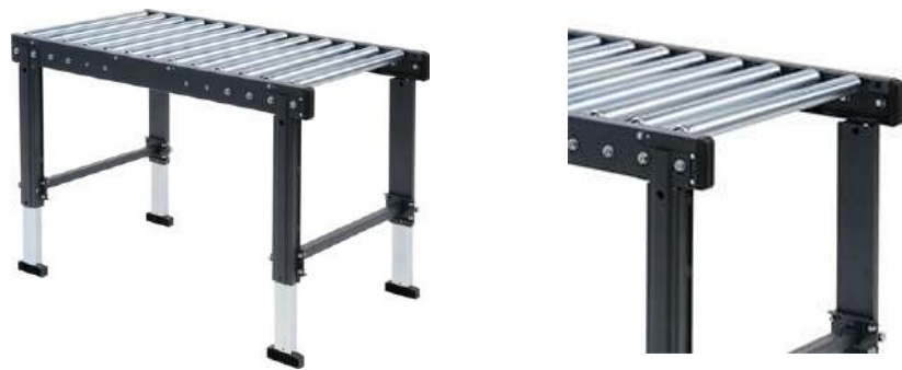
RG- LINEAR FIXED ROLLER CONVEYOR

The fixed roller conveyors transport products without the need for electrical or mechanical transmission. The movement of the rollers can be triggered either manually by an operator or through gravity. This system is versatile and modular, easy to assemble, available in various sizes, and requires no maintenance. Fixed rollers conveyors can be used in connection with different SIAT modules both as infeed and outfeed.